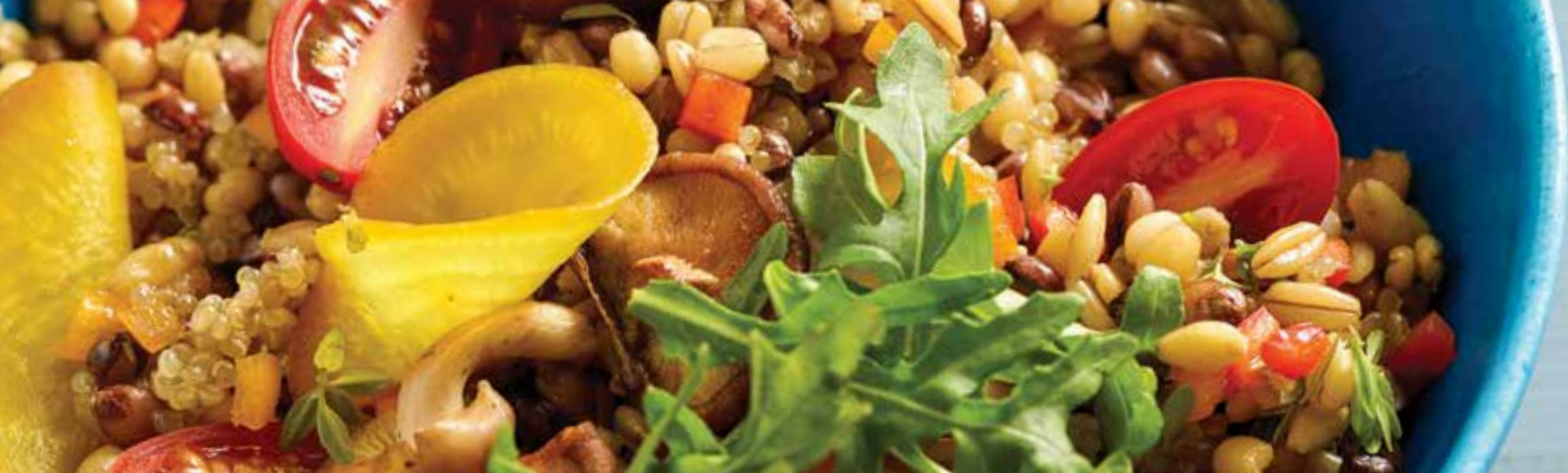
Fresh salad featuring Spelt Berries, Sustagrain® High-Fiber Barley and Quinoa.