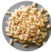
BROWN RICE (STANDARD DENSITY)