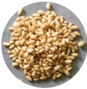
BROWN RICE (HIGH DENSITY)