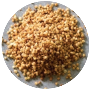
ARDENT MILLS GREAT PLAINS QUINOA™

The Annex by Ardent Mills offers unique, identity-preserved ancient and heirloom grains delivering texture and compelling stories – now in crisp form.