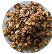
BLACKJACK™ BARLEY FLAKES