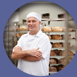
Culinary innovation and our IBR artisan bakery to help create and commercialize your ideas