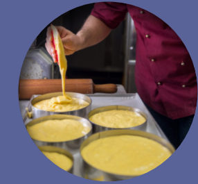
Custom formulations to reduce complexity in your unique recipes