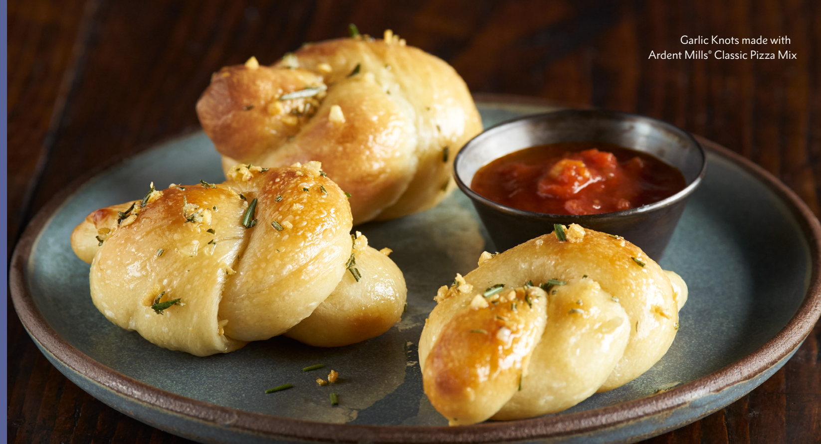
Garlic Knots made with Ardent Mills® Classic Pizza Mix