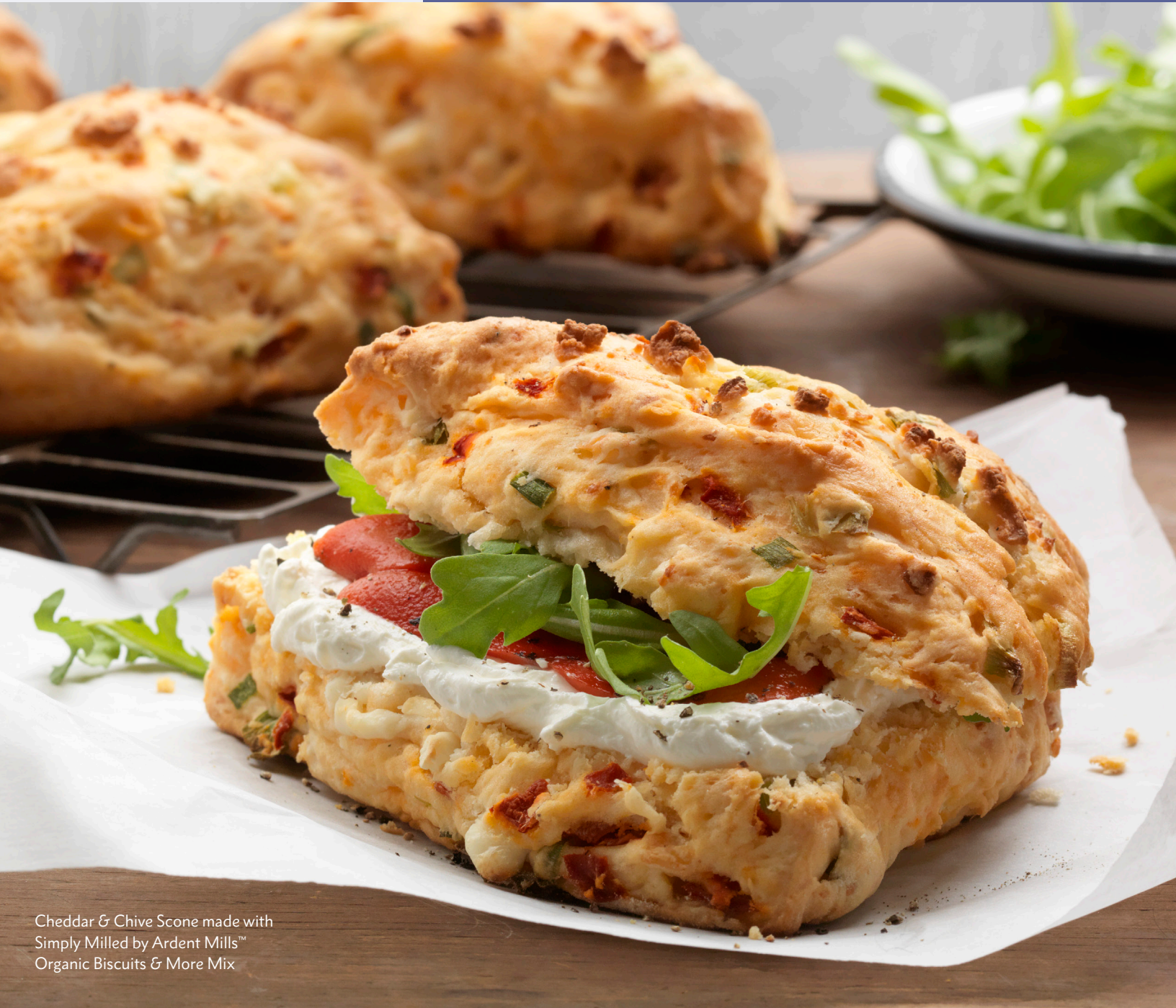
Cheddar & Chive Scone made with Simply Milled by Arden Mills™ Organic Biscuits & More Mix

Simplify your operations with our premium grain & seed blends, flour-based mixes and ingredient pre-blends