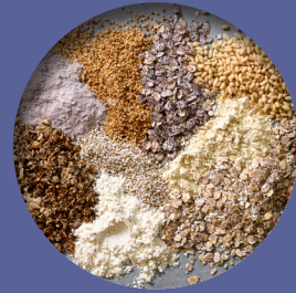
Proprietary and unique ingredients offer nutritional and taste advantages