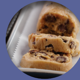
Proprietary Safeguard® technology to address food safety concerns