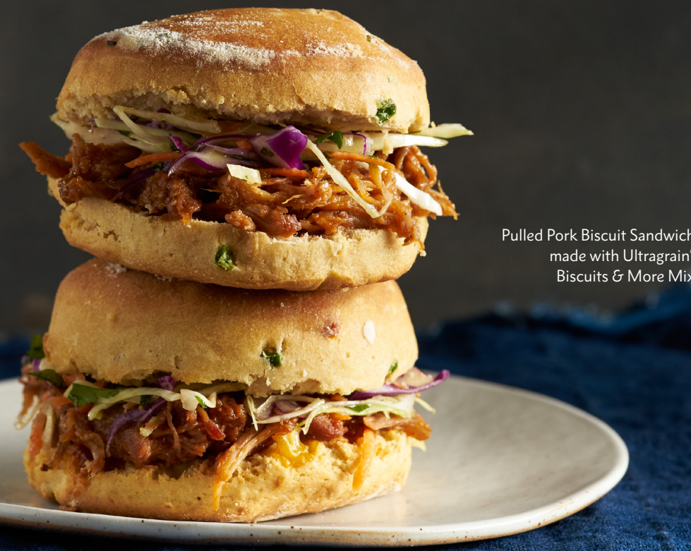
Pulled Pork Biscuit Sandwich made with Ultragrain® Biscuits & More Mix

We have a broad portfolio of off-the-shelf mixes that are exceptionally versatile. But, if you are looking for a custom formula, Ardent Mills has the ingredients and R&D capabilities to create the perfect mix or blend for your needs.