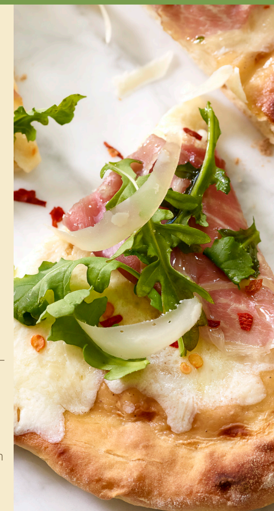
Gourmet Thin-Crust Pizza made with Primo Mulino® Neapolitan-Style Pizza Mix

Got dough problems? We've got answers. Want to get in on the ancient grains trend but don't have available formulation resources? We can create a formulation that hits all the right notes. Put our R&D team to work on a custom-mix formulation to enhance your scratch recipe and ensure crust consistency and quality across your operation. Sample our Simply Milled by Ardent Mills™ Organic Universal, Primo Mulino® Neapolitan-Style or other on-trend pizza mixes.