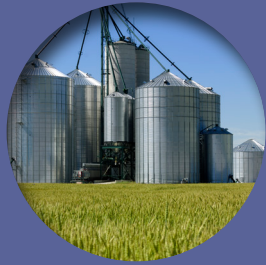
Extensive growing and milling network