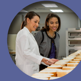
Technical support to improve efficiencies and troubleshoot your process